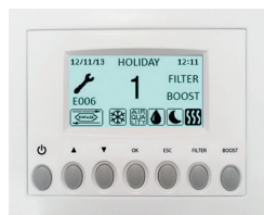
Supplied as standard.